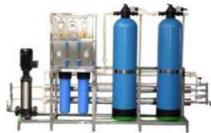
RO & DM water Plant