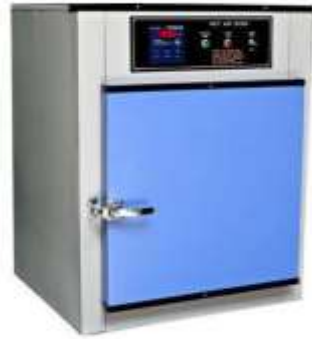
Hot Air Oven