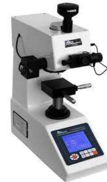
Micro Hardness Tester