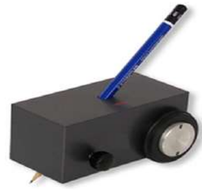
Pencil Hardness Tester